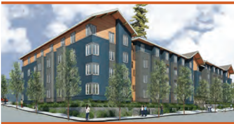
Sept. 15, 2017 | Hazel Heights 12621 SE Stark St. • 153 units of workforce housing • Critically needed permanent housing for people exiting from transitional housing