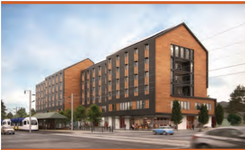
Nov. 6, 2017 | Blackburn Building 25 NE 122nd Ave. at E Burnside St. • Housing for 175 people • Home to CCC’s new Eastside Health & Recovery Center • Integrated primary care, substance use disorder treatment and wellness services