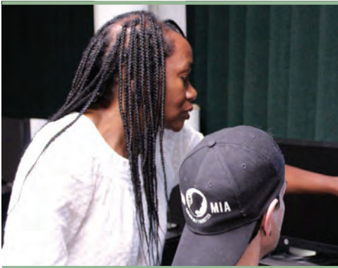
A WorkSource Express employment specialist assists a job seeker.