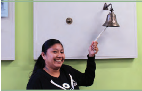
A job seeker rings the bell at the Employment Access Center, signifying a new job!