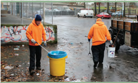
A CCC Clean Start crew improves the landscape