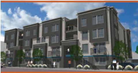
Aug. 2, 2017 | Charlotte B. Rutherford Place 6905 N Interstate Ave. • 51 apartments for families displaced by gentrification • Serves the City of Portland’s North/Northeast Neighborhood housing preference program